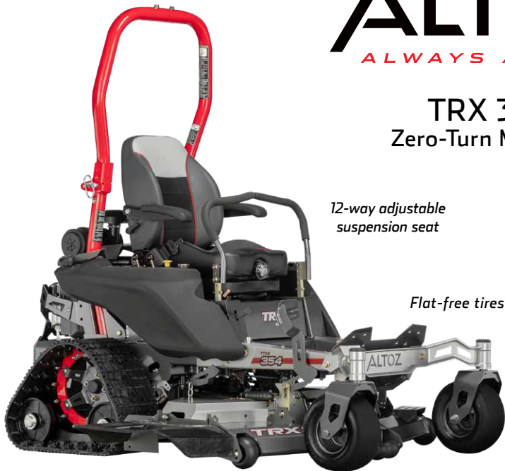
12-way adjustable suspension seat