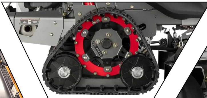
Power through the harshest conditions and rough terrain with the rear-mounted torsional axle and turf track system.