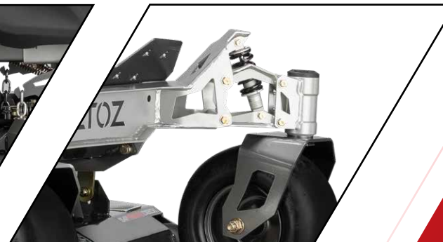
Optional Independent Front Suspension (IFS) smooths out rough terrain for superb comfort and control.